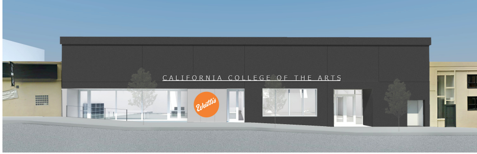
Wattis Institute, 350–360 Kansas Street