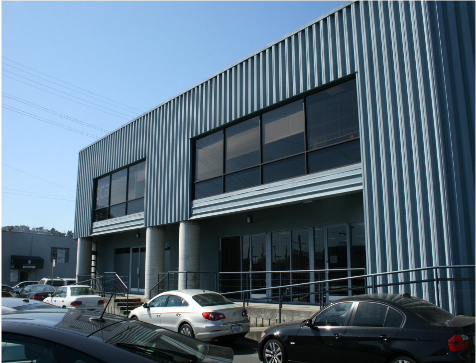
Faculty and Student Center, 80 Carolina Street