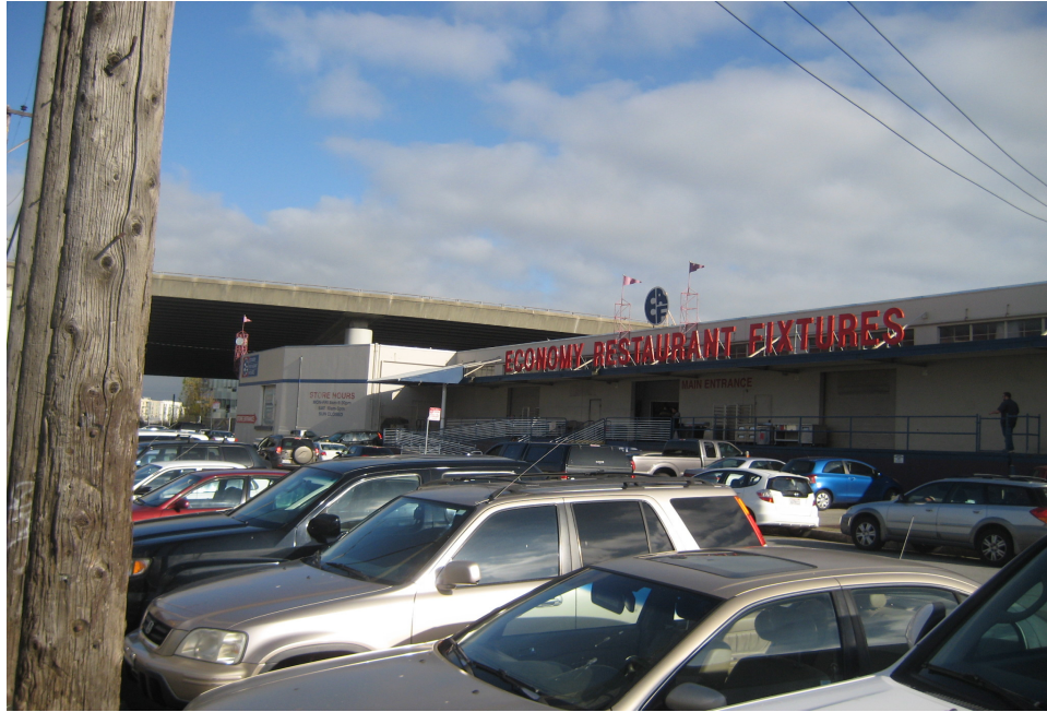
Neighboring business at Irwin and 7 th