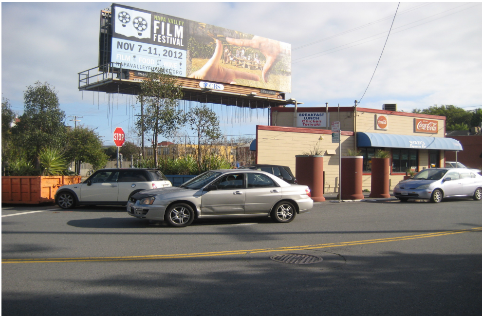
Neighboring lunch shack at 16 th and Wisconsin