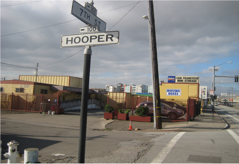
Neighboring business at 7 th and Hooper looking North