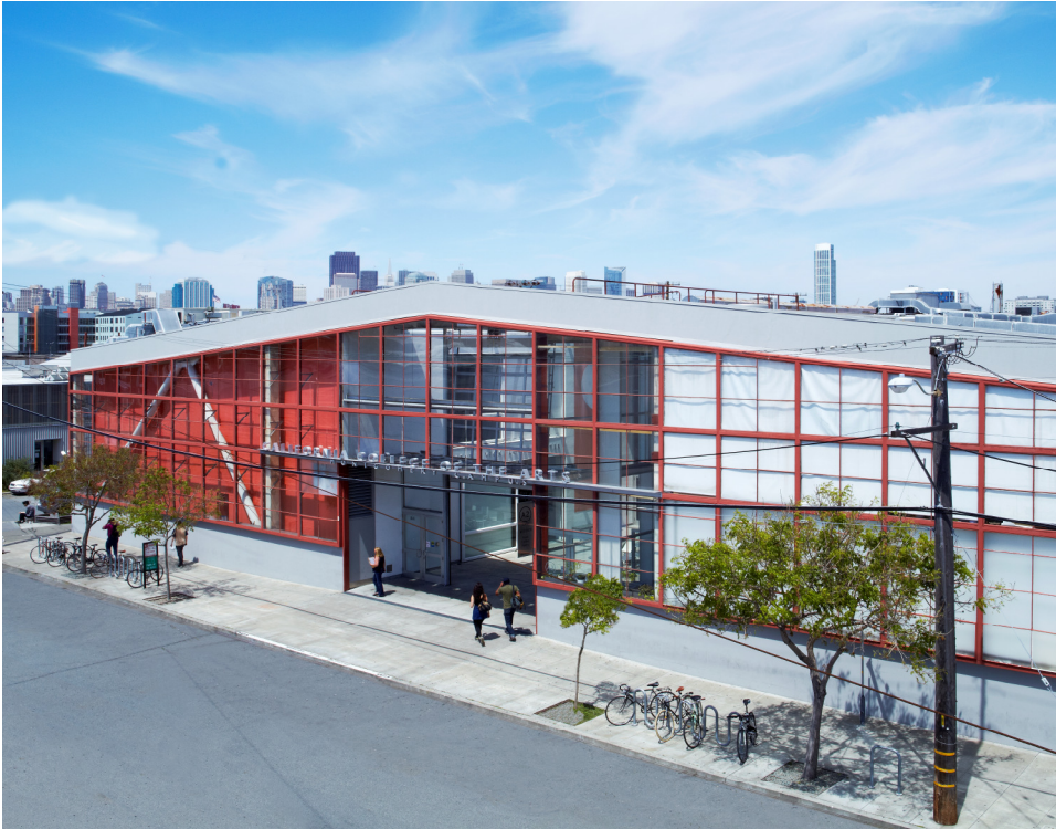
Montgomery Campus, 111 8th Street