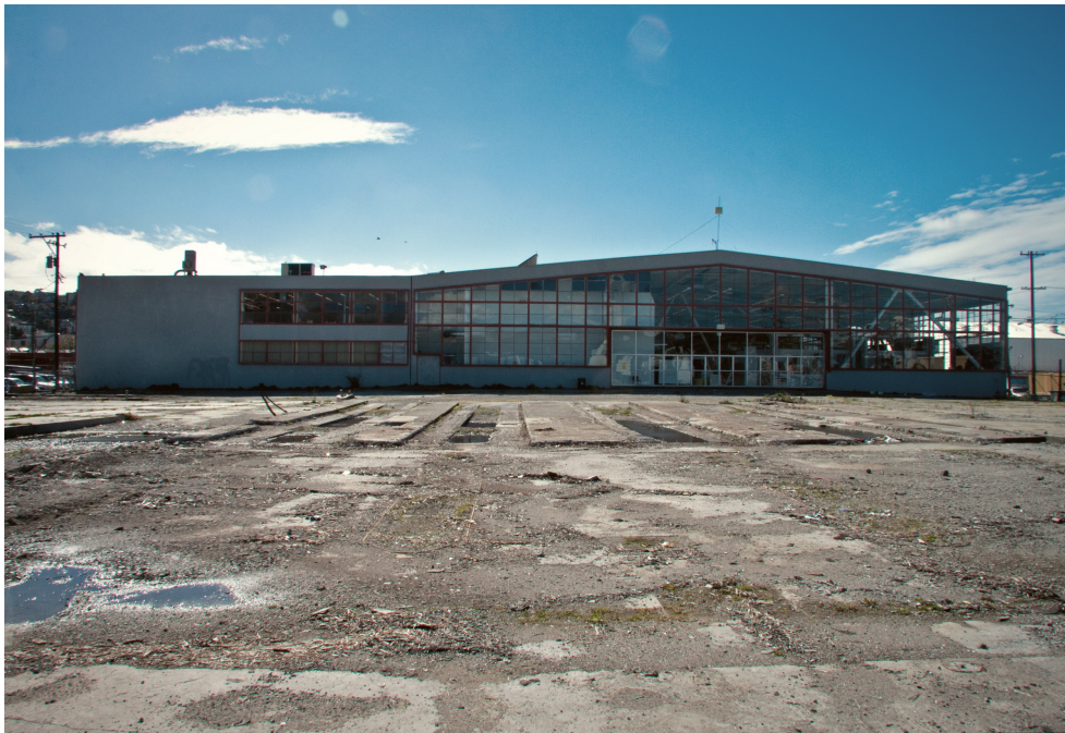
Vacant Lot, 1140 7th Street