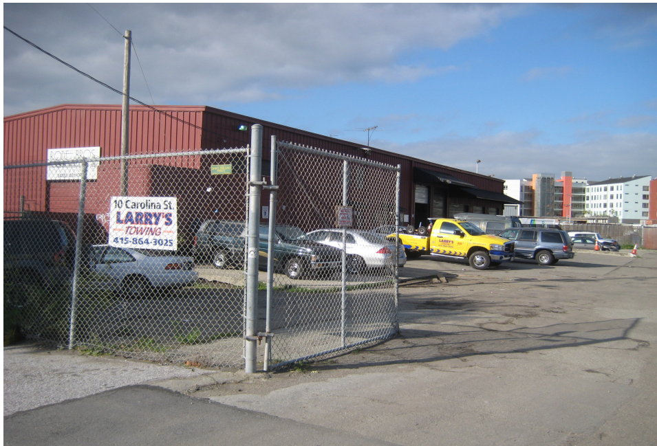
Neighboring business looking NW at Carolina and Channel