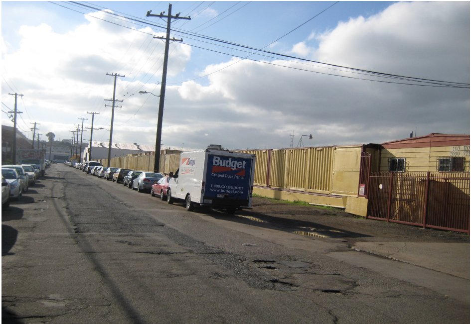
Neighboring business at 7 th looking West on Hooper