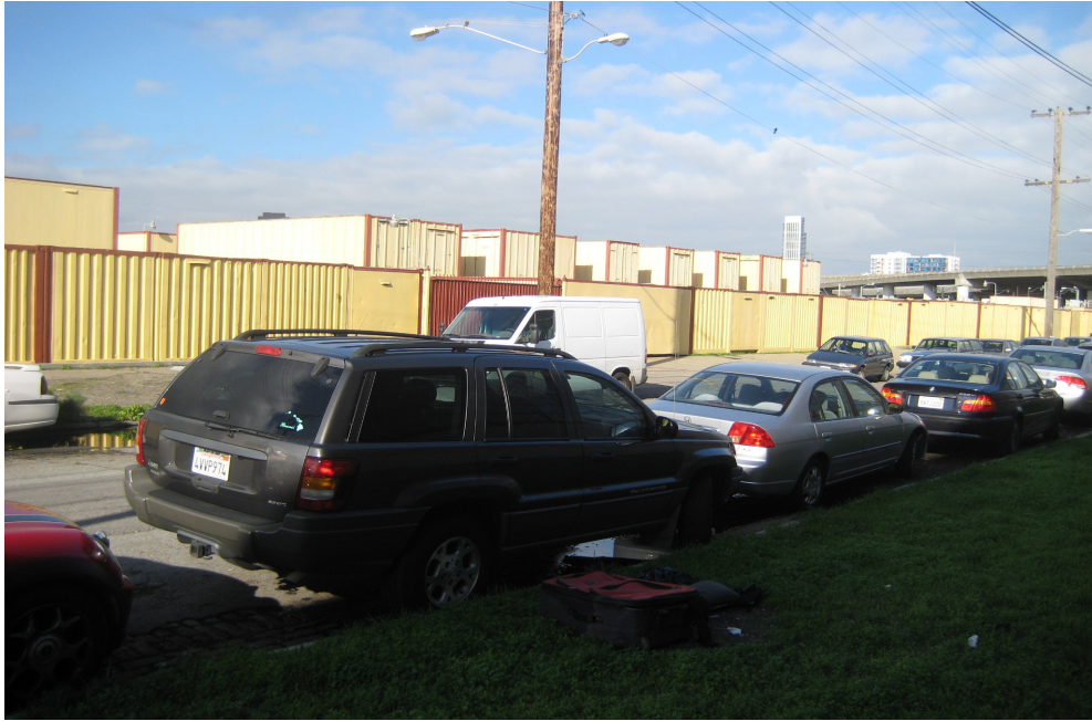
Neighboring business on Hooper looking NE