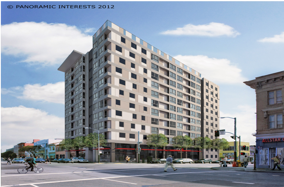
Future Site of Leased Housing, 1321 Mission