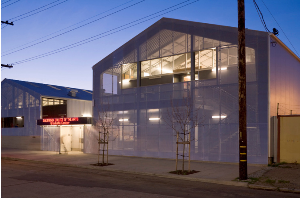
Graduate Center, 184–188 De Haro Street