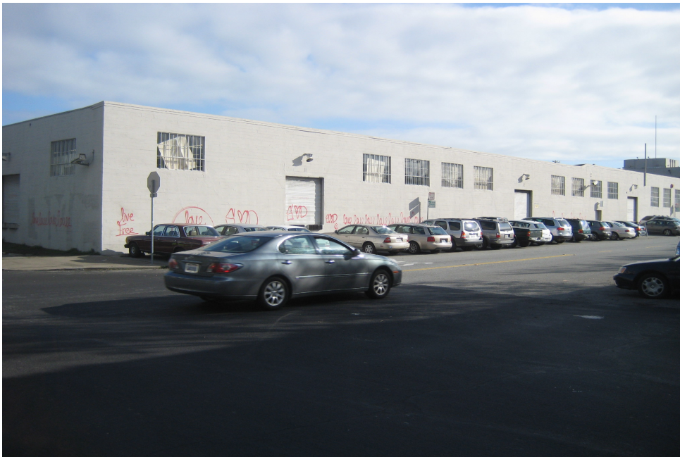
Neighboring business looking SE at De Haro and 15 th