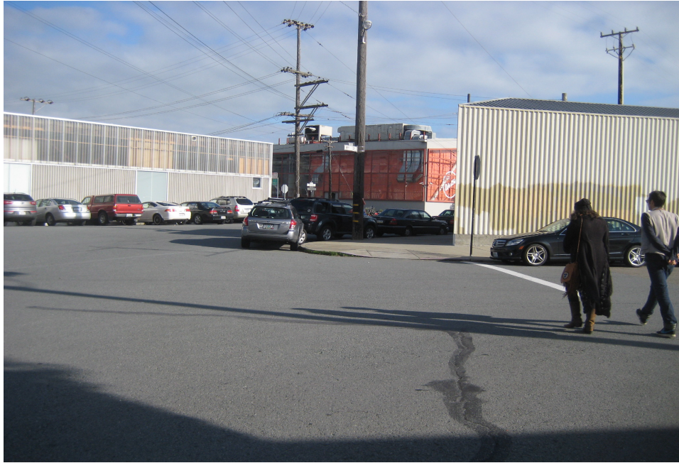
Neighboring business looking SE at Carolina 15 th , 8 th