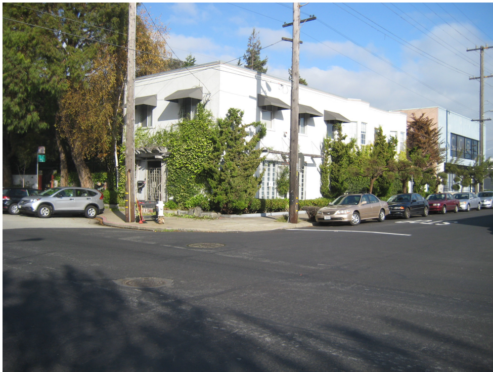
Graduate Writing Studio, 195 De Haro Street