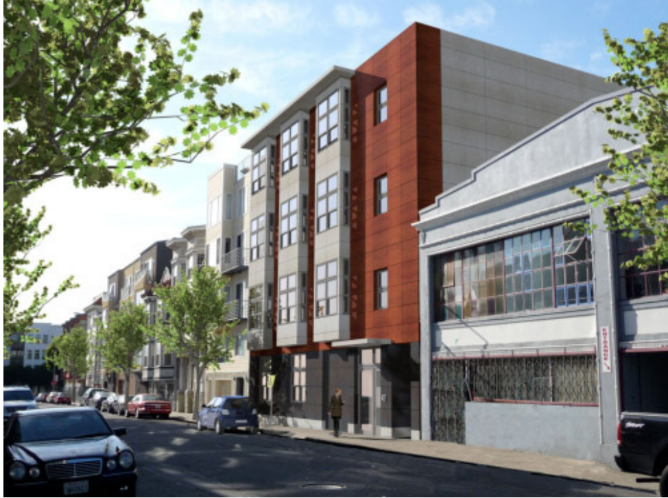
Future Site of Leased Housing, 38 Harriet Street