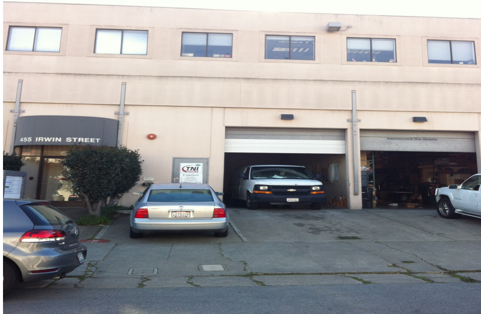
Communications Office, 455 Irwin Street