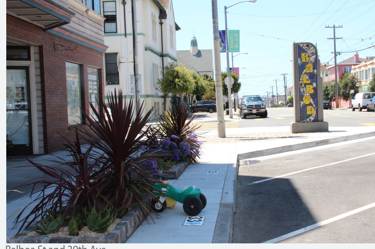
Balboa St and 39th Ave.

Completed in 2014, the Balboa Streetscape Improvements Project provides: