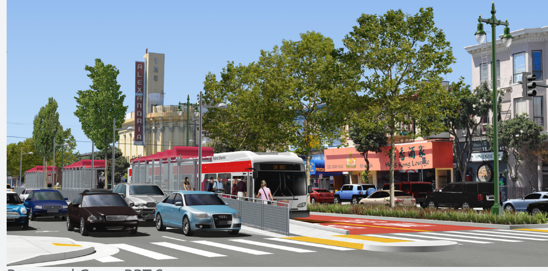
Proposed Geary BRT System

The proposed Geary Bus Rapid Transit (BRT) system will benefit pedestrian access and safety along the corridor to destinations and bus stops.