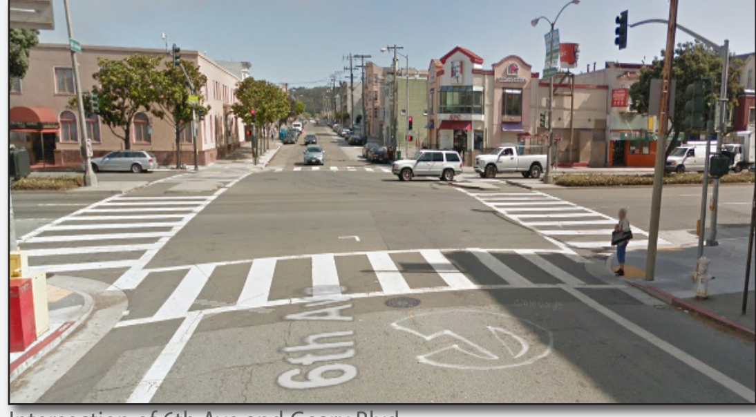
Intersection of 6th Ave and Geary Blvd.

has the highest frequency of pedestrian collisions at intersections in District 1.