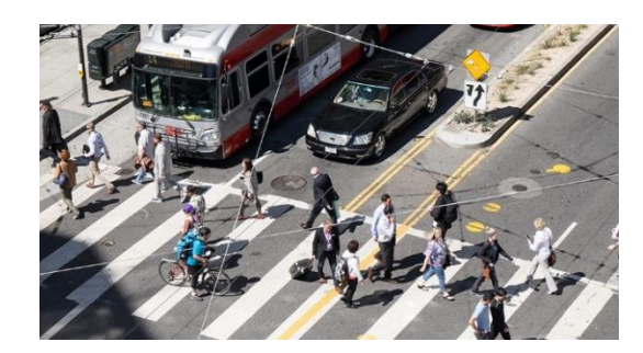
ConnectSF: Interagency vision for transportation future. Potential reauthorization of transportation sales tax.