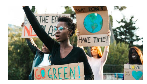
SB1000: Requires cities to update General Plan with Environmental Justice element or policies