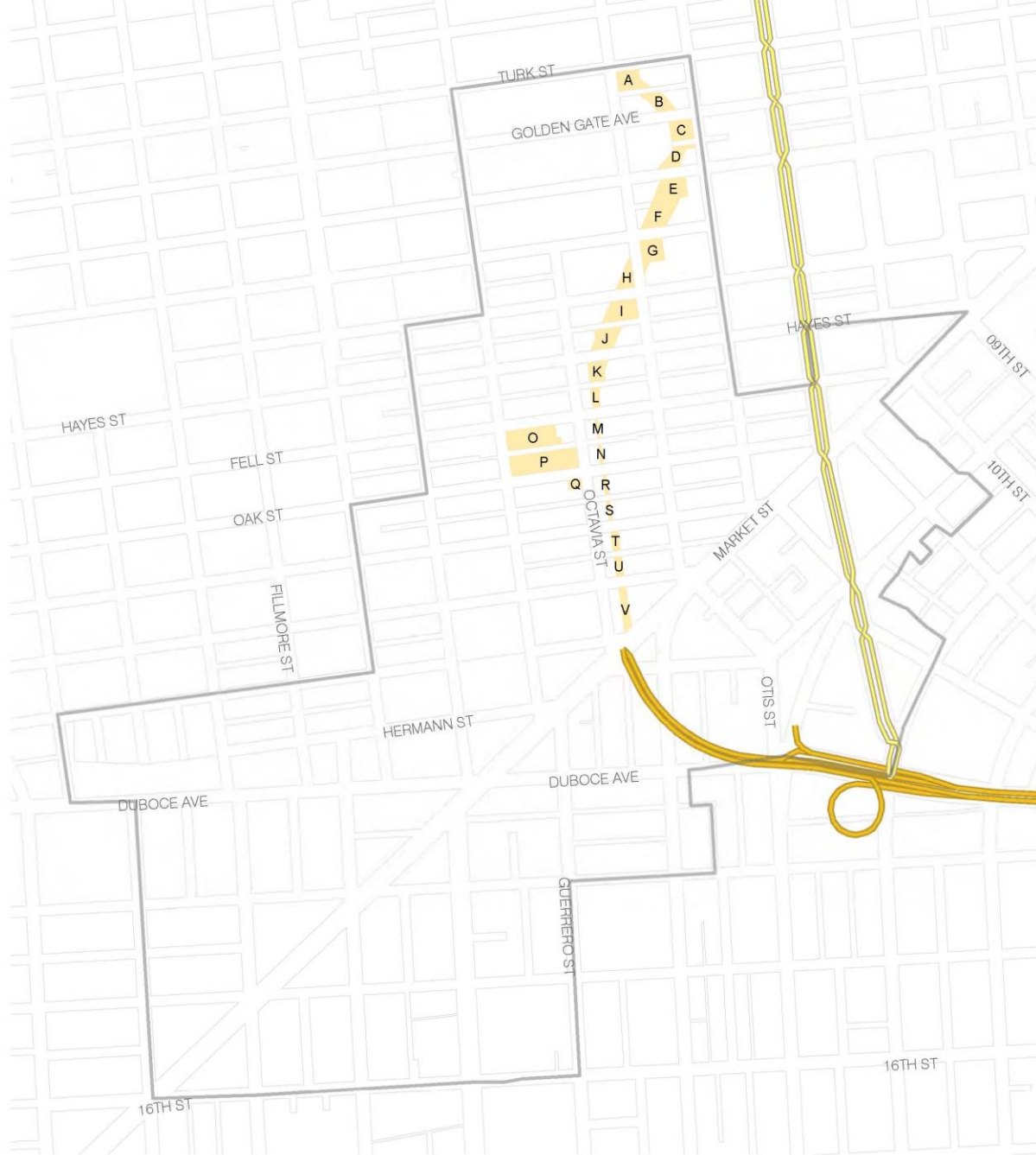
Market Octavia Freeway Parcels