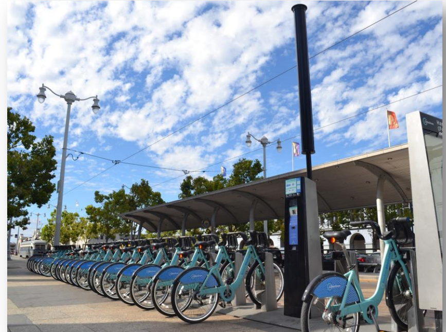
The Bay Area's bike share will be the largest bike share per-capita in the country when expansion is complete