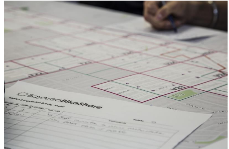
4-6 feasible location options per grid square were presented at public workshops