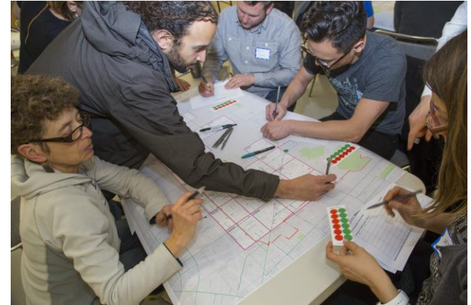
Community members review a map together at a public workshop. Workshops for Phase 1 were held in Districts 6, 8, and 9.